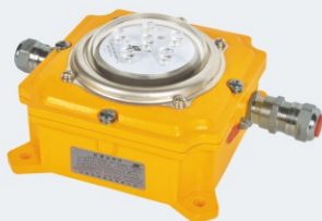
HDL-P Explosion-proof Perimeter Light

Ex II 2 G Ex db eb IIC T6 Gb Ex II 2 D Ex tb IIIC T80℃ Db IP66/IP67