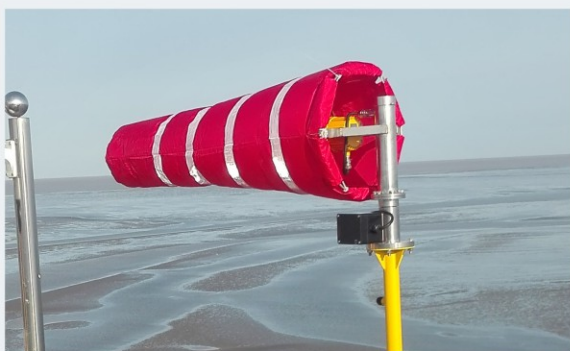
Explosion-proof Wind Direction Lamp