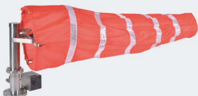
HDL-W Explosion-proof Wind Direction Lamp