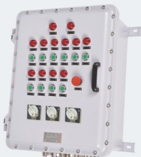
HRMD91 Explosion-proof Distribution Panels