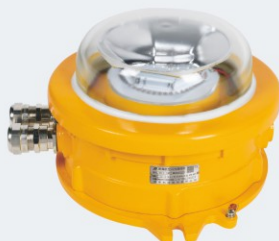
HDL-S Explosion-proof Status Light