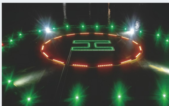
Night View Map of Helicopter Landing Platform Aid System