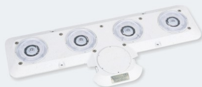
HDL-H Helideck Explosion-proof H Light

Ex II 2 G Ex db eb IIC T6 Gb Ex II 2 D Ex tb IIIC T80℃ Db IP66/IP67