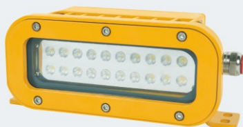
HDL-F Helideck Explosion-proof Floodlight