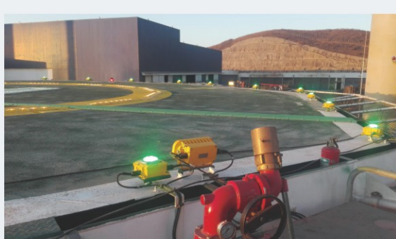
Explosion-proof Perimeter Light