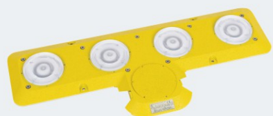
HDL-C Helideck Explosion-proof Circle Light

Ex II 2 G Ex db eb IIC T6 Gb Ex II 2 D Ex tb IIIC T80℃ Db IP66/IP67