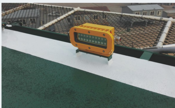
Helideck Explosion-proof Floodlight