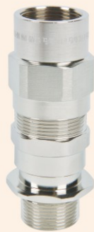
Steel pipe wiring